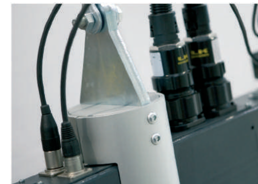
Quick lock connection for easy and fast installation.