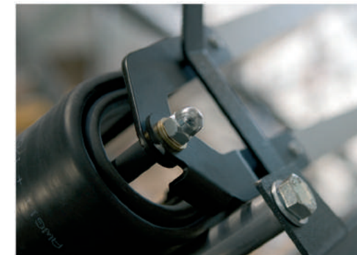
Flip-Flop Cable Management.