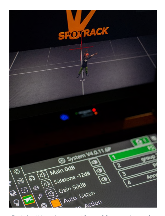
Evolution V4 touchscreen w/ Green-GO comms integration on this display